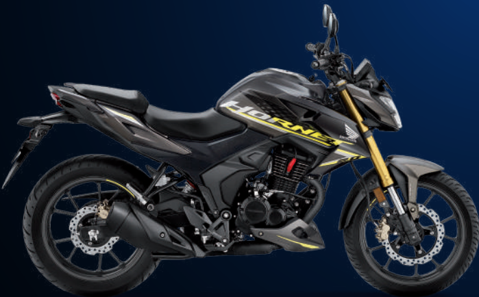
Matte Axis Grey Metallic