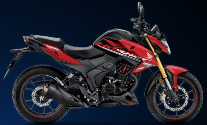
Radiant Red Metallic