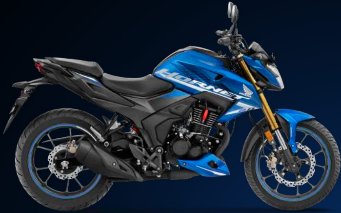
Athletic Blue Metallic