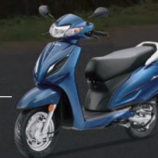
Pearl Siren Blue